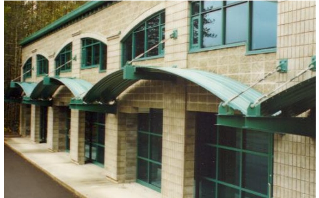
New Commercial Construction - Pohle Ave, Terrace BC