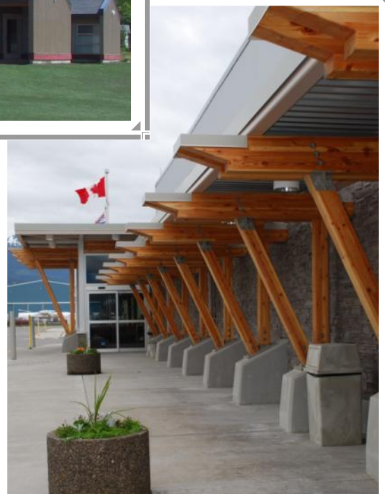
Major Commercial Expansion - Terrace / Kitimat Airport