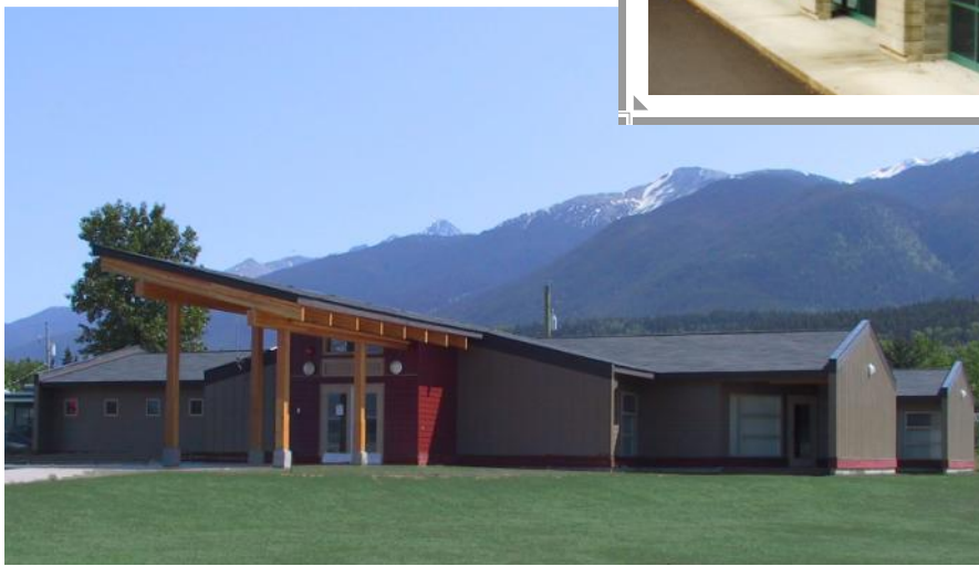
New Institutional Construction - Admin Building, New Aiyansh BC

Suite 4 - 5008 Pohle Avenue Terrace, BC V8G 4S8